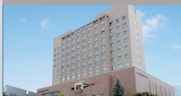
Hotel Nikko Northland Obihiro