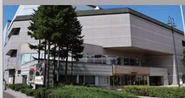
Obihiro Civic Cultural Hall